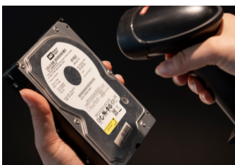
Scans serial numbers of hard disks before erasure